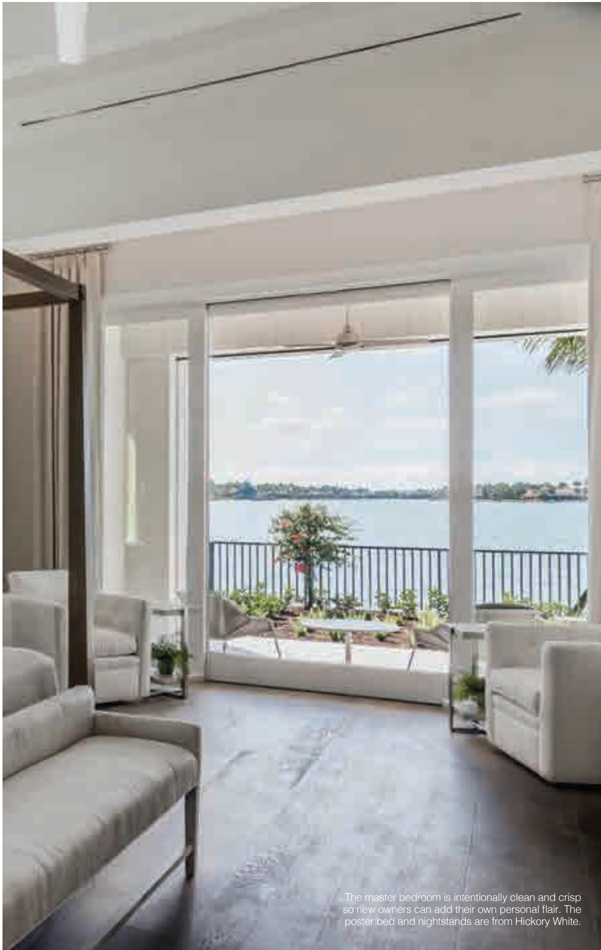
The master bedroom is intentionally clean and crisp so new owners can add their own personal flair. The poster bed and nightstands are from Hickory White.