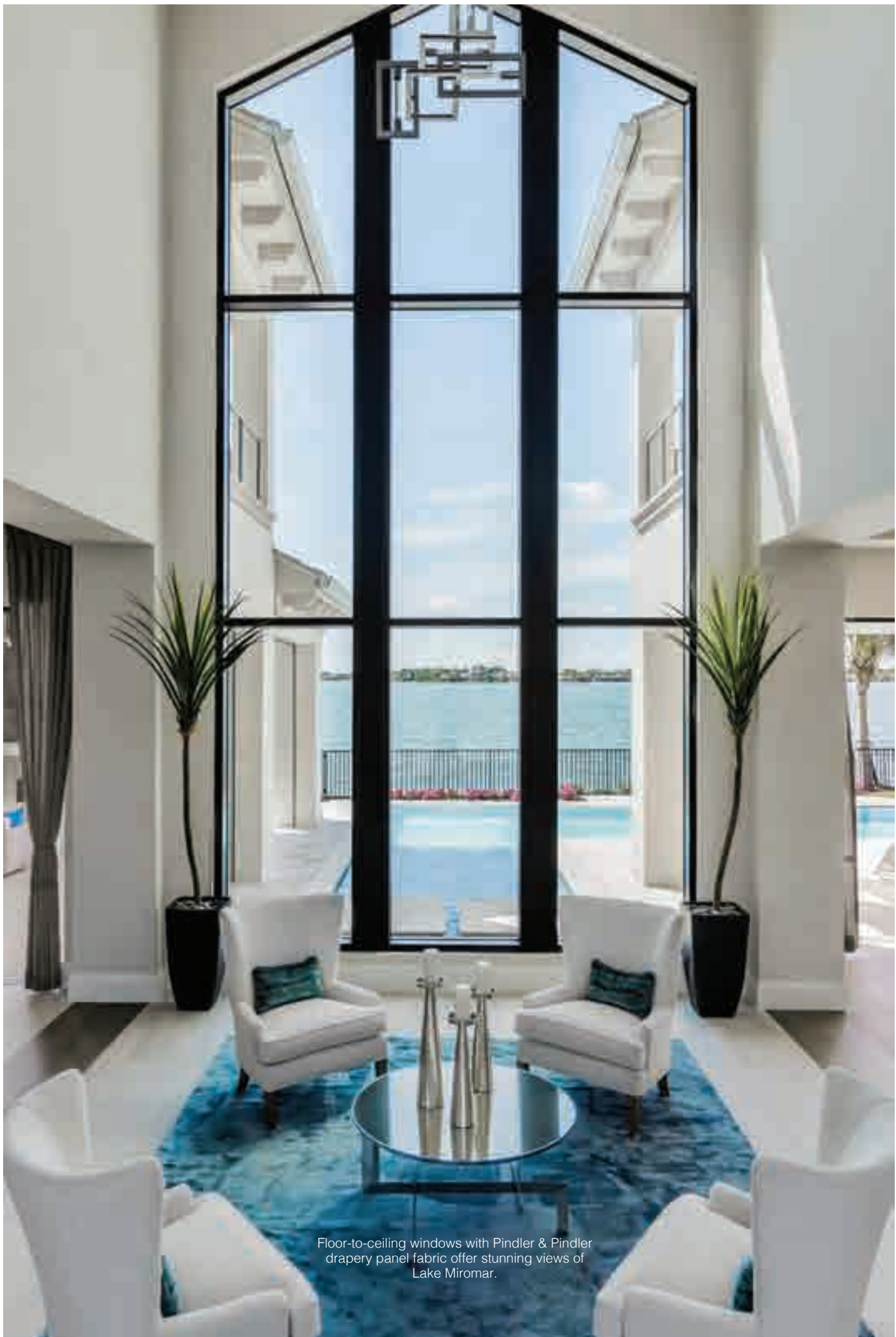
Floor-to-ceiling windows with Pindler & Pindler drapery panel fabric offer stunning views of Lake Miramar.