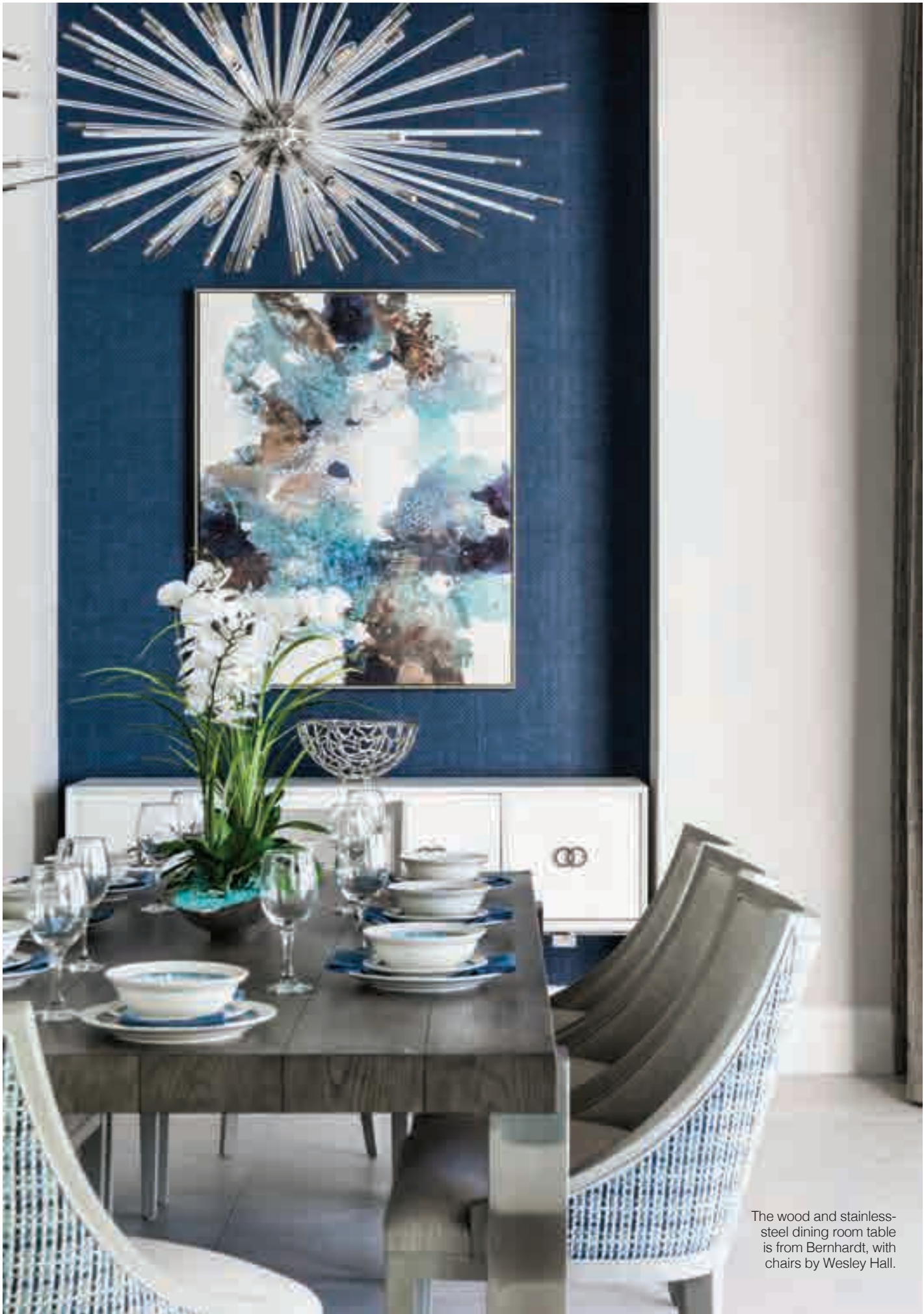
The wood and stainless-steel dining room table is from Bernhardt, with chairs by Wesley Hall.