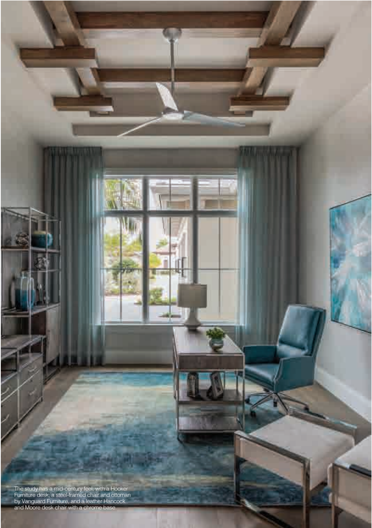
The study has a mid-century feel, with a Hooker Furniture desk, a steel-framed chair and ottoman by Vanguard Furniture, and a leather Hancock and Moore desk chair with a chrome base.