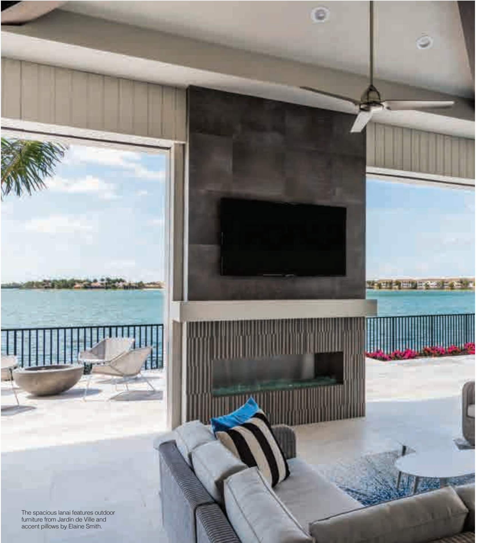
The spacious lanai features outdoor furniture from Jardin de Ville and accent pillows by Elaine Smith.