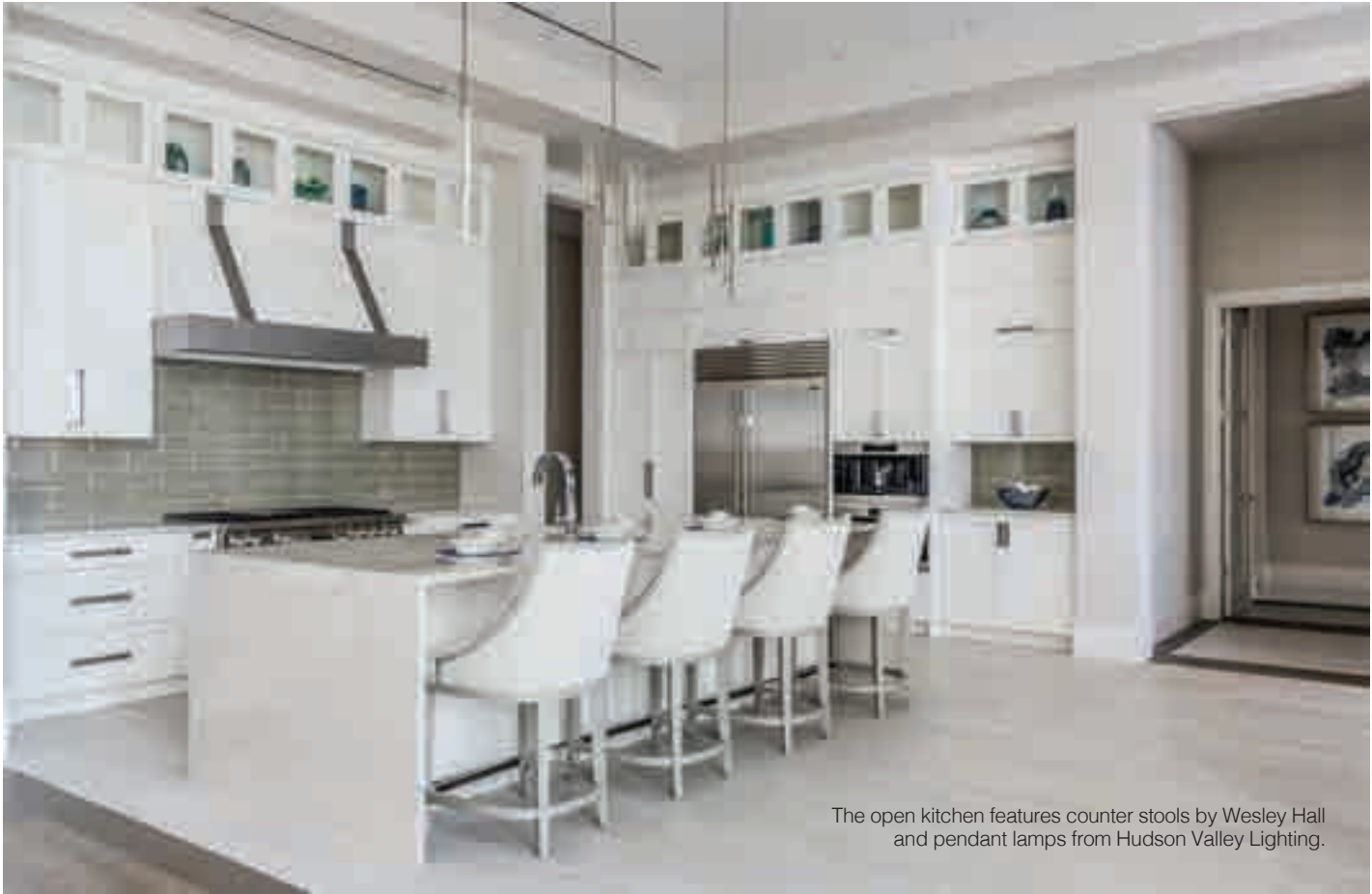
The open kitchen features counter stools by Wesley Hall and pendant lamps from Hudson Valley Lighting.