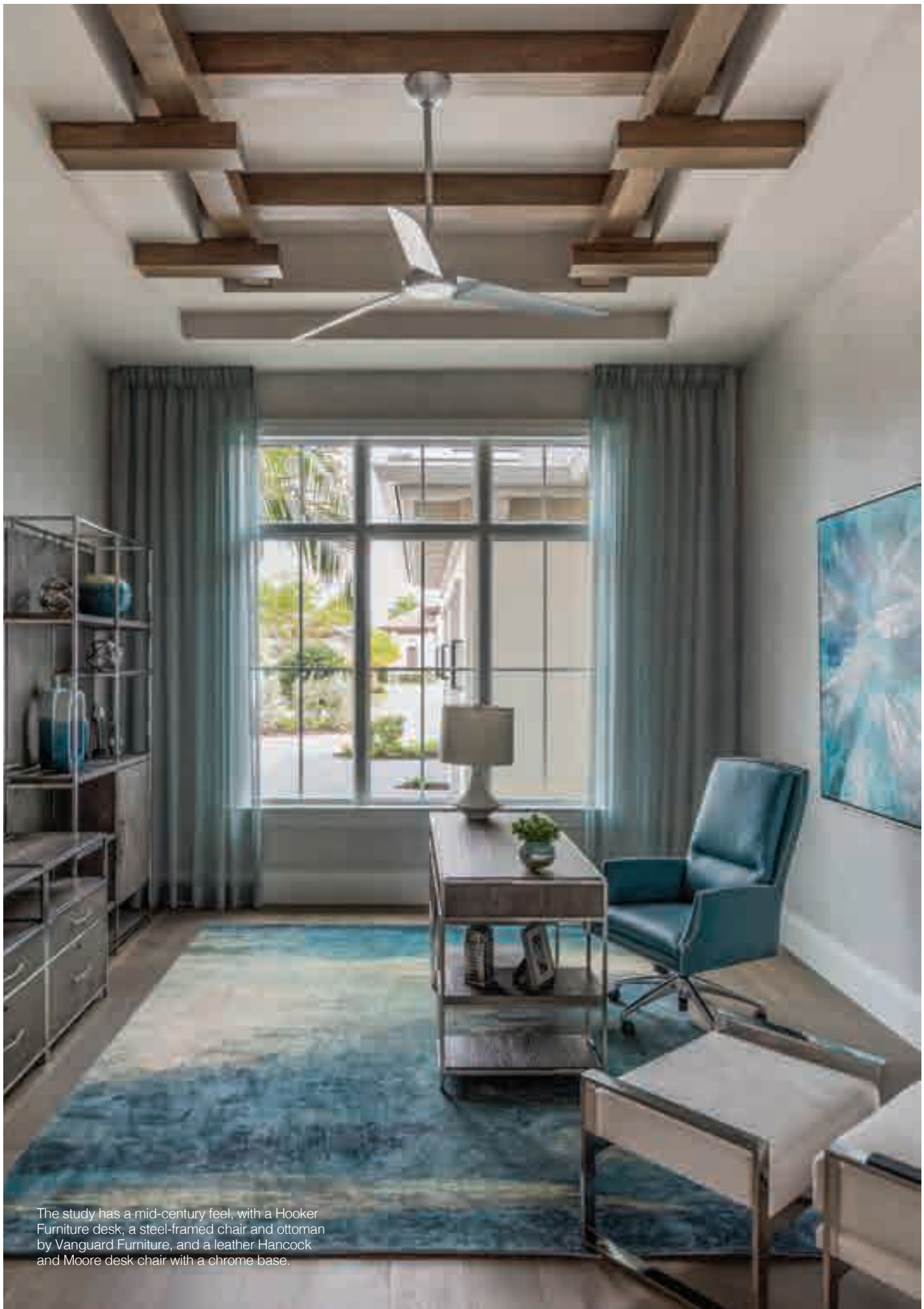
The study has a mid-century feel, with a Hooker Furniture desk, a steel-framed chair and ottoman by Vanguard Furniture, and a leather Hancock and Moore desk chair with a chrome base.