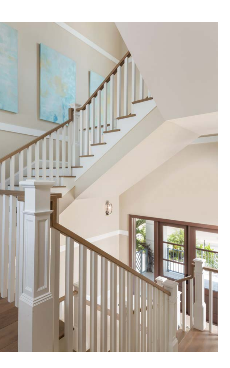
ABOVE: Glass-paneled doors from Smith & DeShields open to an elevated entry, where stairs rise to intermediate landings. Eyes are drawn up and around to a series of custom paintings that add an aqua splash to the neutral palette in complement to the beach beyond.

Ground-level garages, along with pickleball and shuffleboard courts, make use of code-necessitated non-living space. On the main level, the entry steps into a foyer where an Escher-like stairway ascends with multiple landings — each presenting with panoramic views and purposefully open rooms.